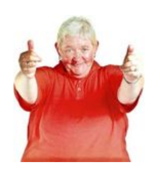
This is the end of the questions.